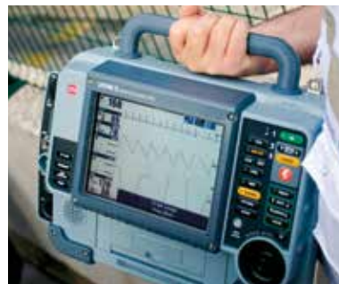
Dual-mode LCD screen with SunVue display