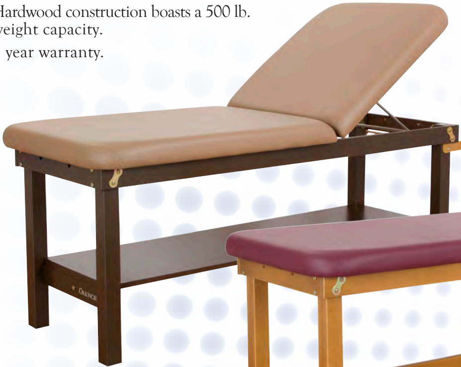
Earth fabric, Chocolate lacquer, and storage shelf

Over 100 color combinations at no extra charge!