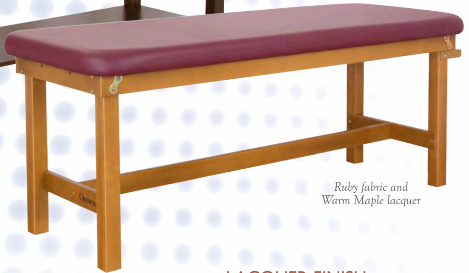
Ruby fabric and Warm Maple lacquer